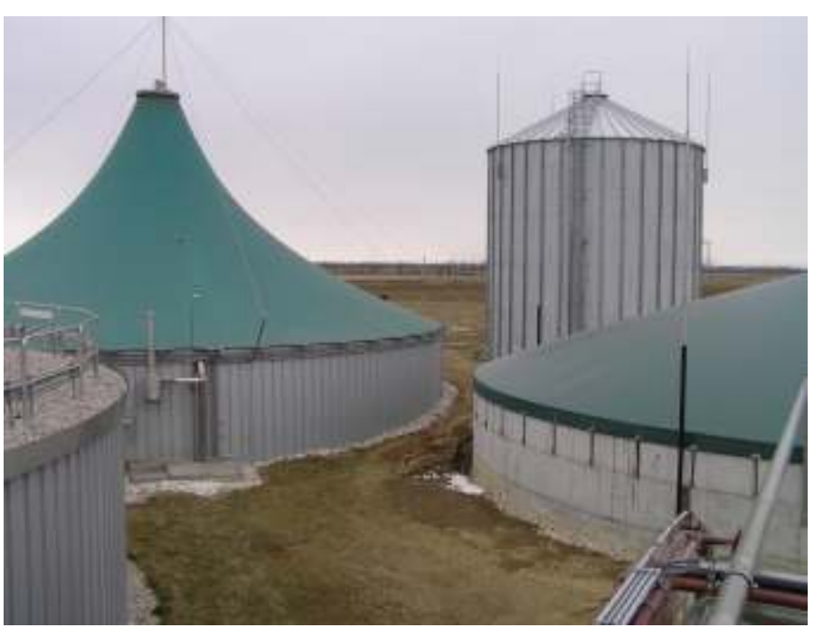
Maize silage and agro-wastes