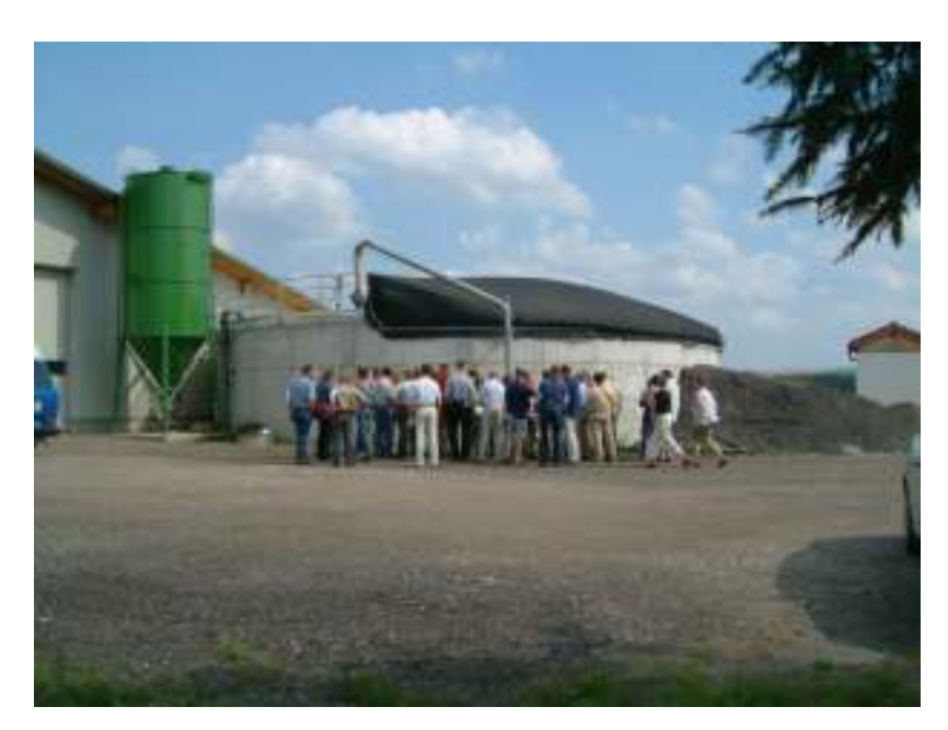
Early German farmbased digesters